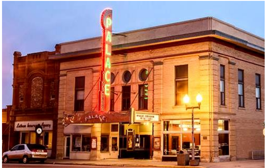
Luverne's beautiful Palace theater was built in 1915.